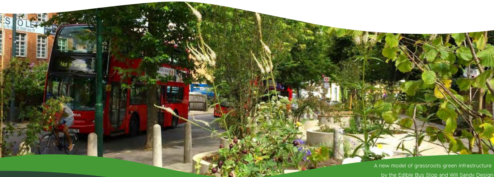
A new model of grassroots green infrastructure by the Edible Bus Stop and Will Sandy Design

Thanks to our members, supporters and partners for helping us to make our city greener