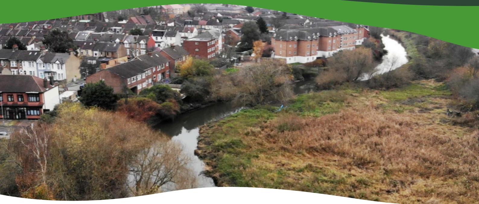
The Edgelands on the River Roding by Noel Moka