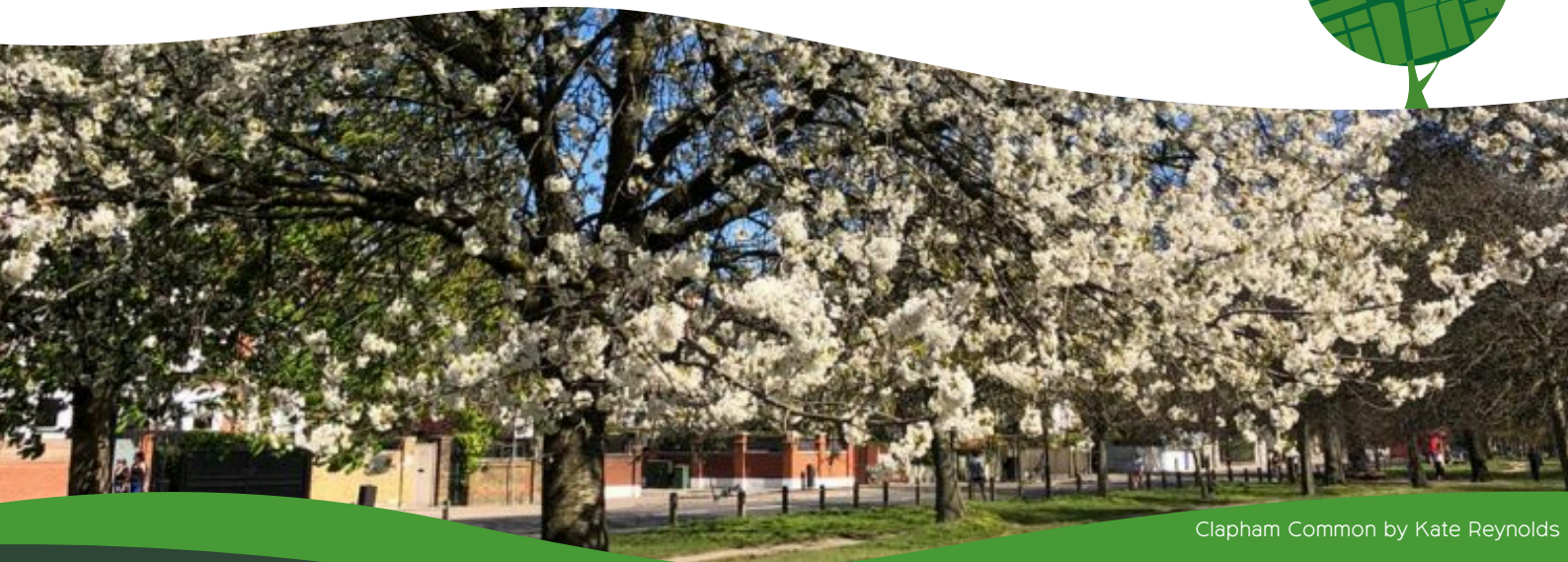
Clapham Common

With thanks to our members, supporters and partners for helping us create a greener city