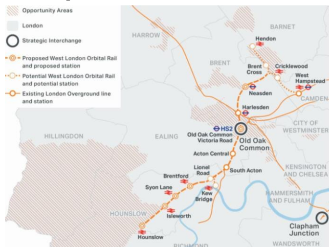
Route for the West London Orbital

Walking and cycling. Cycling in the capital grew by nearly 5% in 2018/19 to its highest recorded level more than four million kilometres. The increase was greatest in central London g Even. TfL announced improved walking and cycling routes between Brentford and Kensington Olympia and between Lea Bridge and Dalston 🔁 🔁 🚟. TfL announced £2.5m to meet growing demand for cycle parking at ten stations. It will also create 1,400 spaces in residential areas 👄. In a letter to the former transport secretary, Chris Grayling, the UK's cycling commissioners described painted cycle lanes as a "gesture" and said they do nothing to make people feel safer on a bike g . Kensington & Chelsea council said it will not support a cycle superhighway between Wood Lane and Notting Hill Gate citing congestion and air quality concerns 🚾 🙎 🚟. TfL has reduced its ambitions for Cycleway 9 along Chiswick High Street in Hounslow after meeting strong local opposition W4 W4.