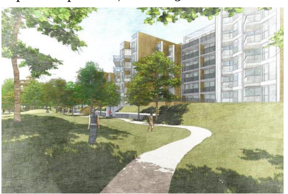
Plans for Sydenham

Bromley council is under threat of being placed in special measures, allowing developers to apply directly to the planning inspectorate, because it had more than 10% of refusals of applications for major developments overturned on appeal. Eleven of 75 appeals were lost during a two year period . An appeal has been allowed for 151 homes on a former factory site in Sydenham. The inspector said a shortage of planned affordable homes in the borough, the high architectural quality of the scheme and its environmental and recreational benefits outweighed the harm to metropolitan open land, which is 38% brownfield.