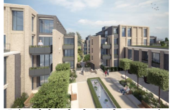
Rejected plans for the Gondar Reservoir

Camden council plans to close the high street to traffic during festive and summer periods and on other days as part of its Low Emission Neighbourhood airq Docomomo UK and the Twentieth Century Society have warned that council refurbishment of Alexandra Road is destroying important original fabric of the grade II* listed estate bd bd. A 1980s Sainsbury's store in north London designed by Nick Grimshaw has become the first supermarket to be listed along with the Grand Union Walk. James Brokenshire refused planning permission for redevelopment in June bd . Plans for an extra care home on the former Gondar underground reservoir were rejected by at appeal. The inspector said building on the entire reservoir would cause significant encroachment into open and green space designations and disrupt long distance views. It would also reduce the perception of green space, as well as damaging a slowworm habitat