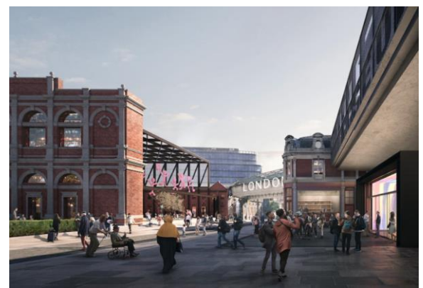
Museum of London public realm plans

City. The controversial Tulip tourist tower has been denied planning consent by Sadiq Khan, overturning the permission given by the City of London in April. He said: "The proposal would compromise the ability to appreciate the outstanding universal value of the Tower of London World Heritage Site and would cause harm to the historic environment, the wider skyline and image of London, strategic views as well as the public space surrounding the site." Historic England and Historic Royal Palaces said the refusal of consent for the 305 metre tower was the correct choice for the capital. bd bd 🤡 🕮. A 10 metre tall advertising plinth incorporating a green wall on the pavement of Leman Street was rejected by a planning inspector who said it would obstruct pedestrians and harm openness 🚱 🚟 The Museum of London has revealed the designs for its new home at Smithfield Market, a scheme that will now cost £332 million 🛗 🚳