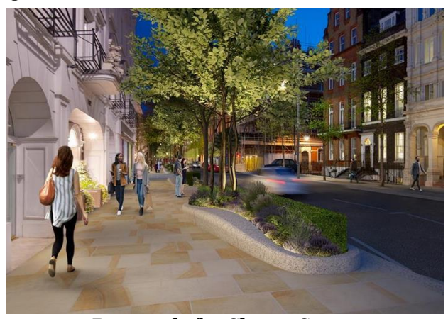
Proposals for Sloane Street

Kensington & Chelsea. After a ten year battle by residents, Clarion Housing Group has now promised to save most of the homes on the Sutton estate instead of demolishing them . Designs have been drawn up to refurbish South Kensington Tube station and add a mixed use building . Work to turn Sloane Street into a green boulevard at a cost of £40 million will begin in the autumn bd.